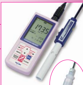
Electrical conductivity cell for pure water

Make sure to select the one that best fits your needs.