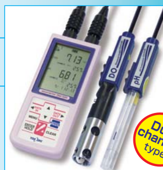
Dual channel type

1) JIS middle type TS19/22 (MAX dia. 18.8mm, MIN dia. 16.6mm, 22mm length)