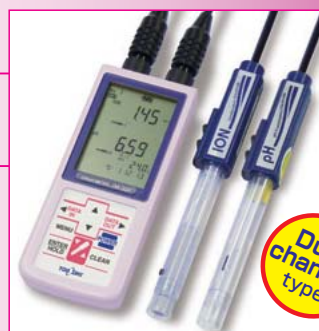
Dual channel type

The ORP electrode, ion electrode, and ion standard solutions are sold separately.