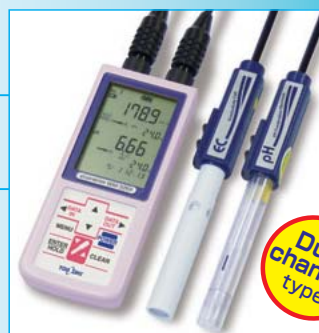
Dual channel type