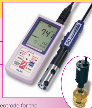
DO electrode for the incubator bottle

1) JIS middle type TS19/22 (MAX dia. 18.8mm, MIN dia. 16.6mm, 22mm length)